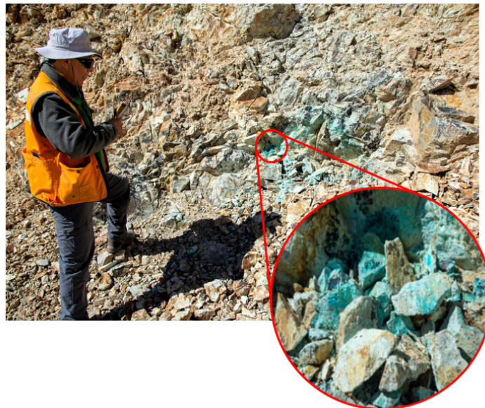
Figure 2: Independent QP and photograph showing quartz-sericitic alteration with green and black copper oxides (chrysocolla, copper wad, tenorite) at Calvario.