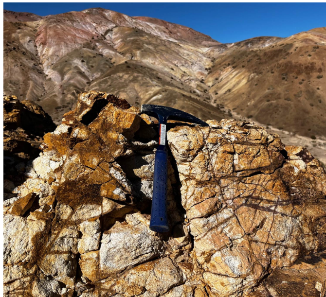
Figure 3: Outcrop of rocks affected by intense argillic alteration and veinlets of types C and D at Mirador, typical of fertile copper porphyry systems.

Mirador represents a porphyry copper ( \pm Mo \pm Au) system, currently exposed at the upper-porphyry to epithermal levels (see figure 3), probably representing the base of a lithocap overlying the proposed porphyry copper target(s). Potential for high-sulphidation, epithermal copper-gold also exists. Extensive quartz-sericite and argillic alteration characterise the northern sector of the alteration zone.